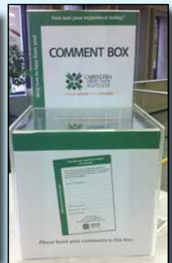
Left to right: slide 1 of our in-branch TV ads for Follow-Up Member Service calls, comment ballot example, & in-branch comment box