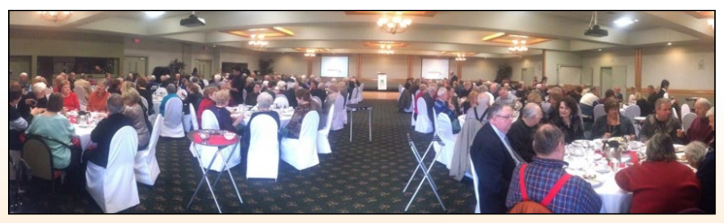
(above): a room filled with Gold Account members at our 21st Annual Gold Luncheon held on Thursday, December 5th, 2013

Carpathia Credit Union held its 21st annual Gold Account Luncheon at Canada Inns Garden City on Thursday, December 5th, 2013. The event drew a loyal following of over 200 people, despite some bad weather and road conditions.